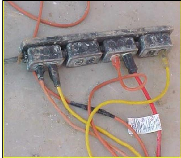
(Electrical outlet boxes used for temporary power supply)