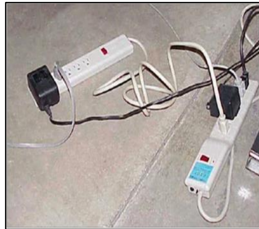
(Power strips permanently mounted / daisy chained)